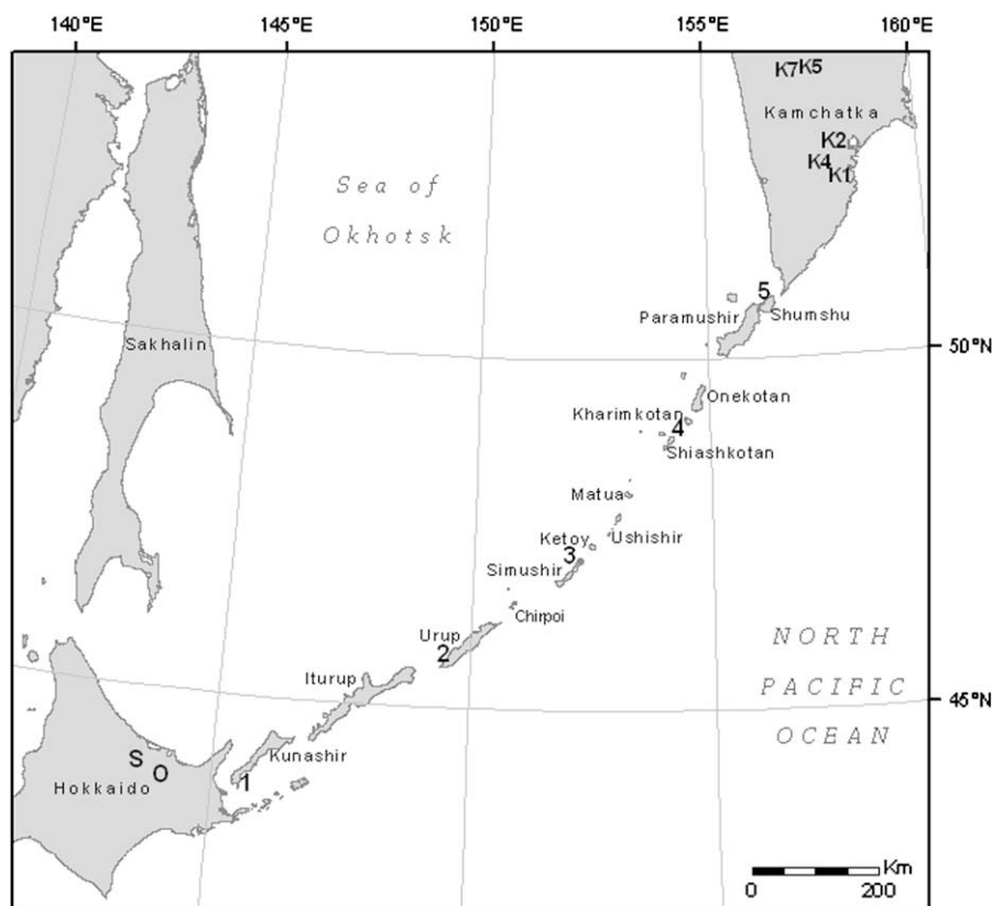
Fig. 1. Map of study area where obsidian artifacts from the Kuril Islands were recovered, including archaeological sites and obsidian source group locations mentioned in the text. Archaeological sites: (1) Rikorda, Kunashir Island; (2) Ainu Creek, Urup Island; (3) Vodopodnaya 2, Simushir Island; (4) Drobnyye, Shiashkotan Island; (5) Baikova, Shumshu Island. Obsidian source groups: (O) Oketo group; (S) Shirataki group; (K1) Kamchatka-1 group; (K2) Kamchatka-2 group; (K4) Kamchatka-4 group; (K5) Kamchatka-5 group; (K7) Kamchatka-7 group. Note that the locations of Kamchatka-1, Kamchatka-2, and Kamchatka-4 are a best approximation of where these sources are suspected to be located. Even if the locations are incorrect, these groups almost certainly occur in the southern portion of the peninsula.

buried 100 cm below the surface and under 10 tephra layers (Fitzhugh et al., 2002). The geology of this region includes various rock types, such as obsidian, andesite, chert and siliceous tuffs of varying colors that were available to the prehistoric inhabitants of the Kuril Islands (Izuho and Sato, 2007).