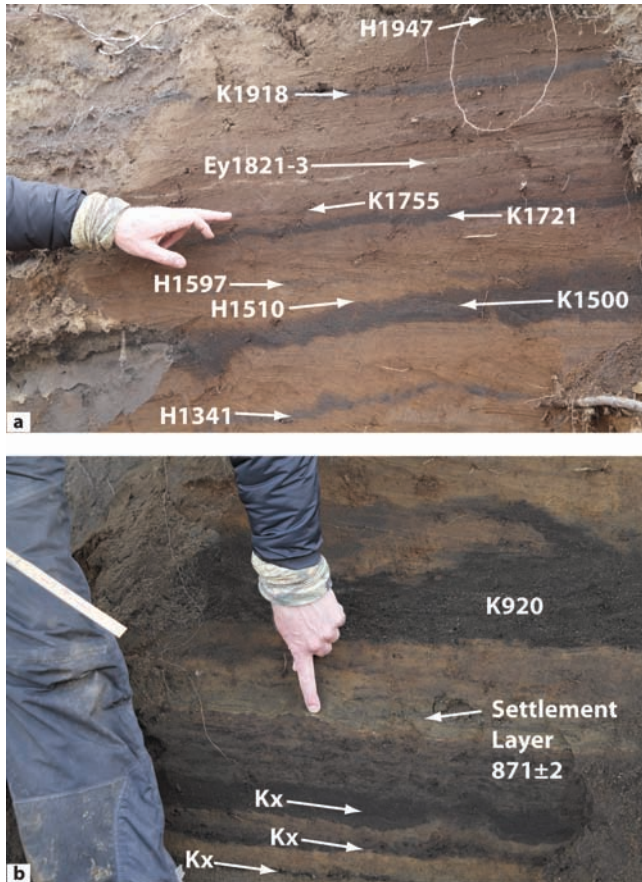
Figure 2a. Profiles on the south side of the Markarfljót valley, north of Eyjafjallajökull (Figure 1) contain a frequency of recent tephra layers typical of many part of the south. The basaltic layers of Katla have very similar major element characteristics and the constituent grains in isolation are indistinguishable in the field. In section and in context different tephra layers can be firmly identified: in this section, for example, K1918 can be identified by its position between H1947 and Ey1821; K1755 and K1721 by their co-occurrence and K1500 either by its very close association with H1510, or its more general location between H1597 and H1341. Figure 2b. The Settlement Layer tephra effectively marks the first human settlement (Landnám) of Iceland. This tephra is a distinctive layer with a lower silicic part (by the finger tip) and an upper olive grey/green layer that includes a crystal fraction. The Katla layers below Landnám form isochrons as precise as those above, but their calendar or sidereal dates are not known with the same accuracy or precision. Even though the basaltic tephtras from Katla may be indistinguishable in isolation they can form a distinctive and diagnostic bar code of thicker and thinner layers.

Mynd 2a. Í jarðvegssniðum á svæðinu norðan Eyjafjallajökuls og sunnan Markarfljóts er fjöldi gjóskulaga í jarðvegi dæmigerður fyrir mörg svæði á Suðurlandi. Basaltgjóskulögin frá Kötlu hafa mjög svipaða efnasamsetningu og eru það lík útlits að þau þekkjast ekki sundur í felti. Í sniði og í samhengi við önnur gjóskulög má þekkja Kötulögin í sundur: Í þessu sniði má t.d. þekkja K1918 af legu þess milli gjóskulaganna H1947 og Ey1821; K1755 og K1721 finnast saman og þekkjast þannig, og K1500 má annað hvort þekkja af fylgni þess við gjóskulagið H1510 eða legu þess milli gjóskulaganna H1597 og H1341. Mynd 2b. Landnámslagið féll um svipað leyti og landnám hófst á Íslandi. Hér er þetta gjóskulag auðþekkt af neðri hluta úr ljósri, súrri gjósku (við fingurgóminn) og efri hluta úr basískri, ólífugrárri/grænni gjósku með kristöllum. Kötulögin neðan við Landnámslagið mynda jafntímaflæti sem eru jafn nákvæmir og þeir sem gjóskulögin ofar í sniðinu mynda, en aldur þeirra í almanaksárum eða stjörnuárum er ekki þekktur af sömu nákvæmni og Landnámslagsins. Jafnvel þótt ekki sé hægt að þekkja einstök Kötulgjóskulög geta þau myndað einkennandi og auðþekkt röð af þykkri og þynnri lögum, líkt og strikamerki.