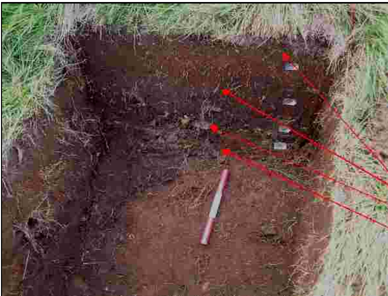
The test pit 6 rapidly reveals well stratified midden materials, requiring a larger excavation unit for effective observation and recovery.