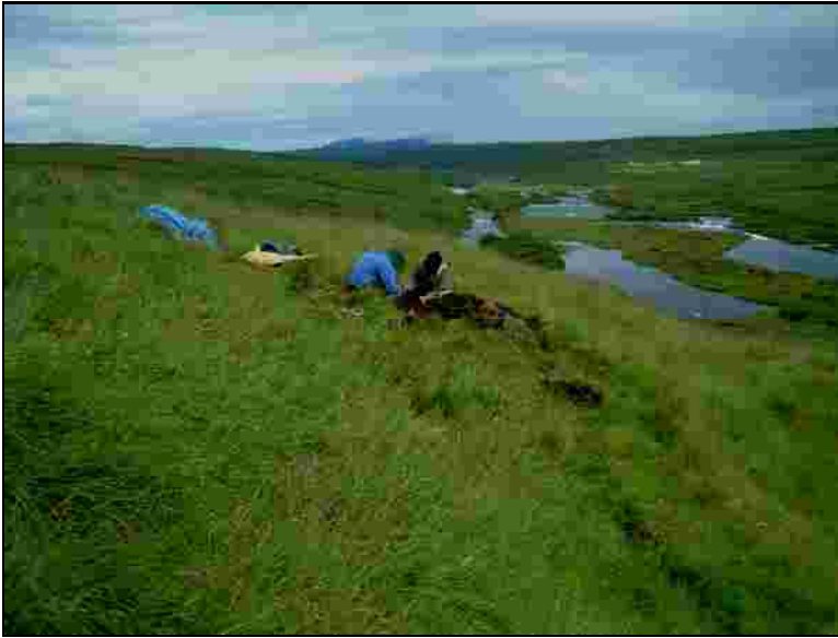
Test pit 6 is opened around core 42. Laxá river valley and the site of Hofstaðir are visible in background.