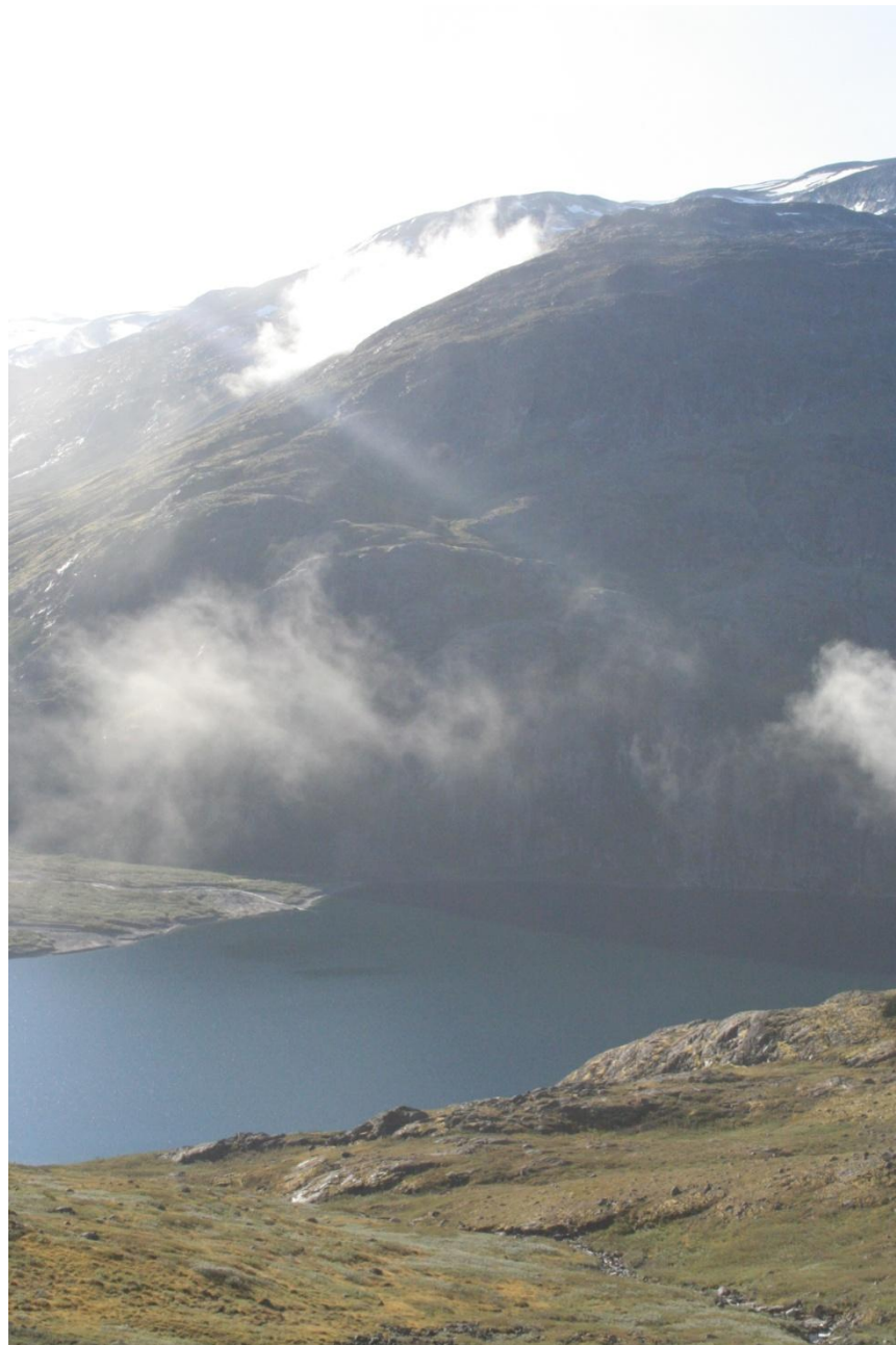
Vatnahverfi – with the many lakes