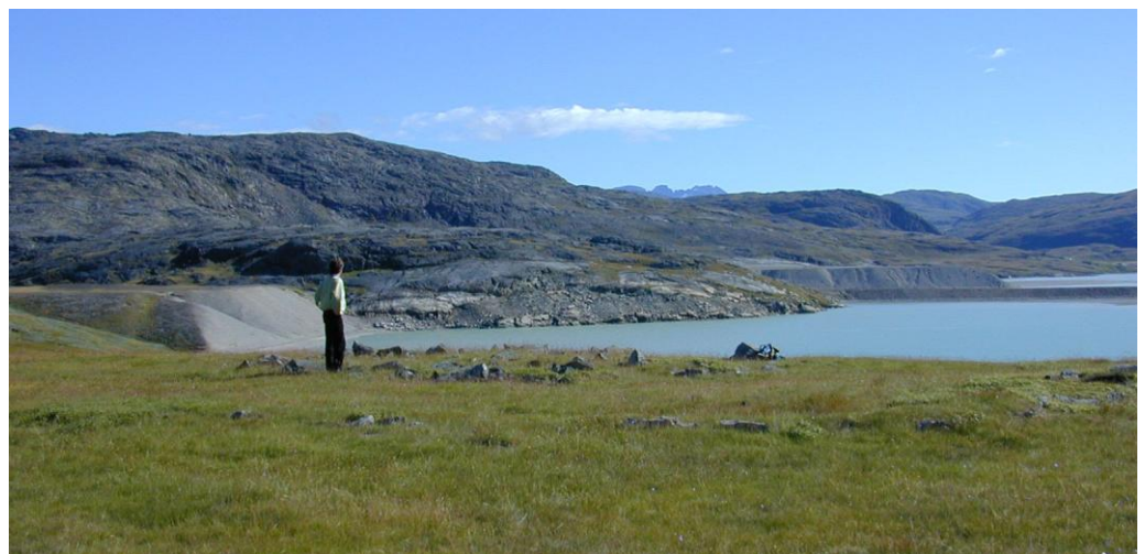
The church at Ø64. In the foreground the circular dyke surrounding church and churchyard

in conjunction with the form of the cemetery and the construction of the church building, it appears that small churches, built primarily of turf - in contrast to the later stone churches – with their circular cemeteries are the oldest. It also appears that several of these small churches have been taken out of use presumably during the 12 th and 13 th centuries. These findings immediately raised new questions: Why were some of churches taken out of use? What role did Christianity play in the Norse settlements? Or was it only the cemetery, which was no longer in use? Who lies buried in the cemeteries? How did the early settlers live, compared to those that lived in later periods?