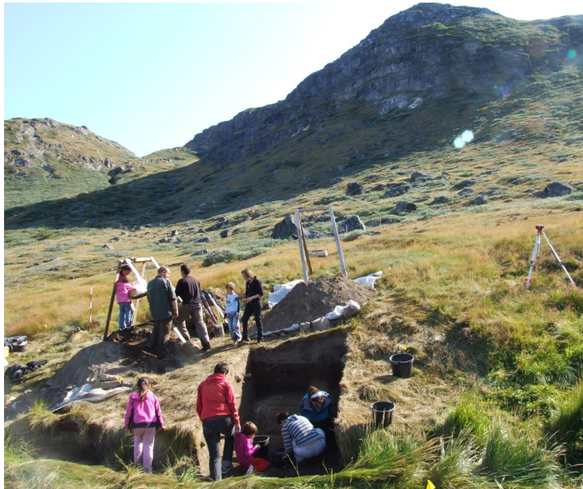
School kids from the school in Vatnahverfi excavating Norse midden, august 2008.