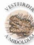
MEDIEVAL WESTFJORDS SOCIETY