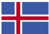
Government of Iceland