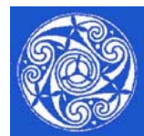
Global Human Ecodynamics Alliance