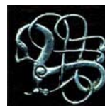
North Atlantic Biocultural Organization